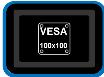
VESA for wall-mount