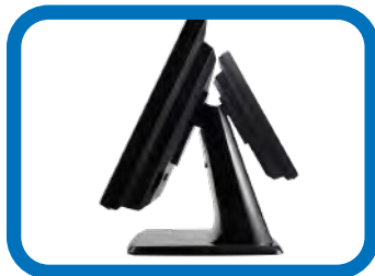
2nd LCD creates interactive display