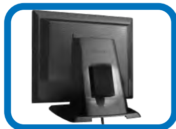
Power Adaptor Compartment