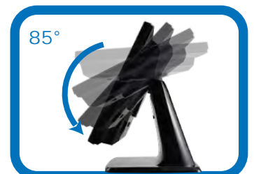
0°~85° Viewing angle