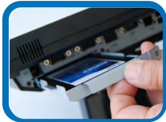
Easy storage maintenance design