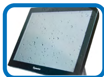
Splash-resistant on frontal