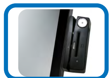
MSR / SCR and i-Button optional