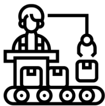
Factory production line

Application : The TPC series is slim but robust to meet various location: