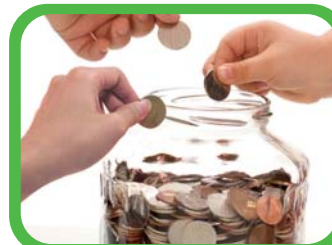
Zero cost for operation system