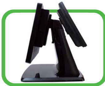
2nd LCD creates interactive display