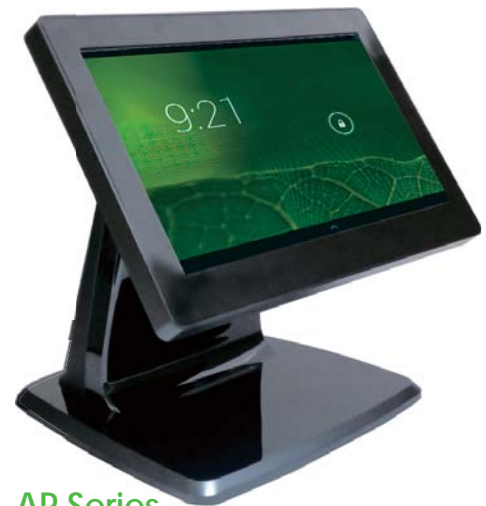
AP Series With 12" / 15" / 15.6" LED LCD