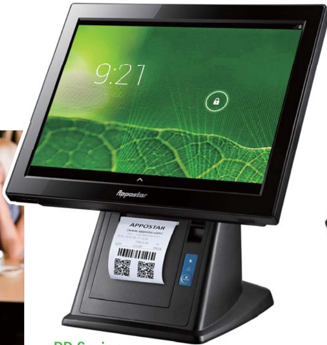
RP Series With 3" integrated thermal printer