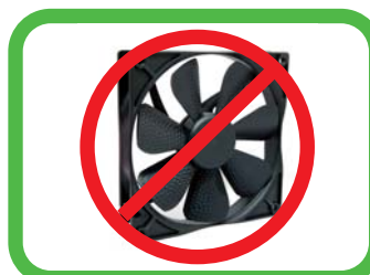
Fanless solution / Easy maintenance