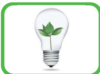
Low power consumption