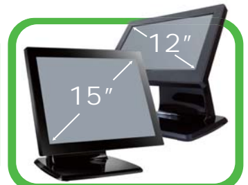
12" or 15" LED LCD resistive or 15" capacitive touch monitor