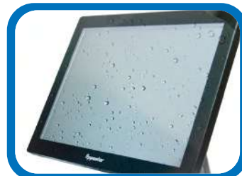
Splash-resistant on frontal