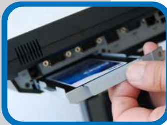
Easy storage maintenance design

The New! GP-series models are elegant and powerful all-in-one systems, designed for the toughest retail and hospitality environments. Its robust and compact system fits beautifully on any point of sale counter. Its modular design features ensures guaranteed high serviceability.