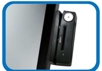
MSR / SCR and i-Button optional