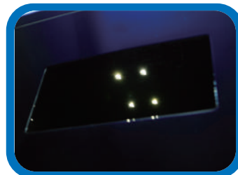
Supports most popular barcode symbologies