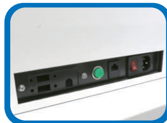
External I/O: LAN, switch, power available