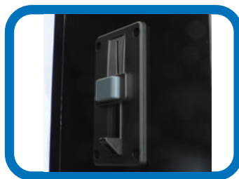
Up to 96% of acceptance rate