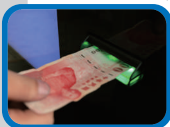
Multiple currency available